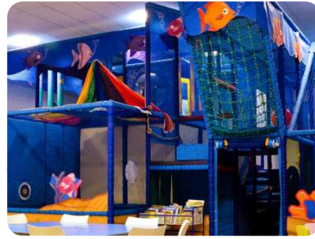
Warrington Play and Sensory Centre

If the problem hasn't been resolved and further support is needed, our early help teams are here to support you.