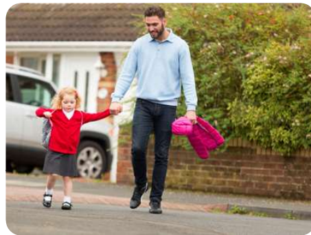
Family support, parenting and parental conflict