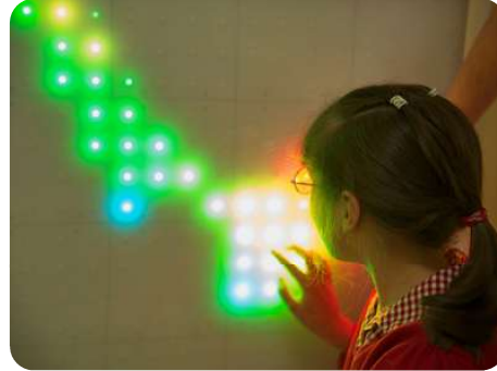
Support for children with SEND