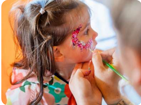
Children's centres and Family hubs