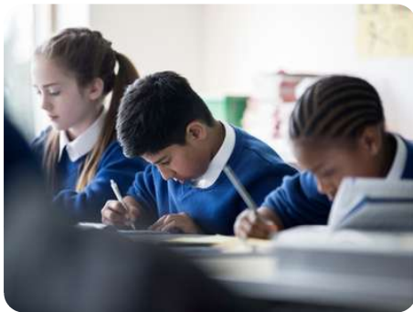
Education, early years and childcare

Any professional working with a family, such as schools, health services and voluntary sector organisations, can offer early help services as soon as they can see that advice or support may be needed.