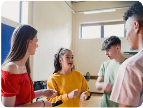
Warrington Youth Service